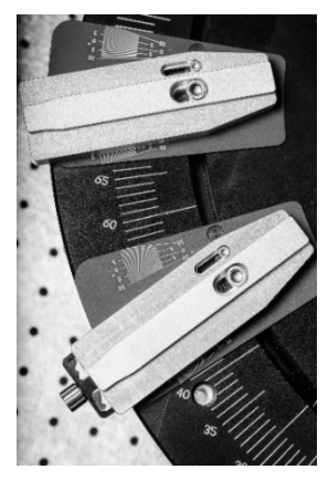
Follow us on:

We are proud to present our novel flexible patch angle mechanism, that helps to set the angles for the 3D log. Now you can use our LNPrism to manipulate the adjusted angle and to set the angle value in our SM10 remote<sup>touch</sup>. The rotational angle and the patch angle can be set easily. Together with guided calibration routine, you can increase the accuracy if needed.